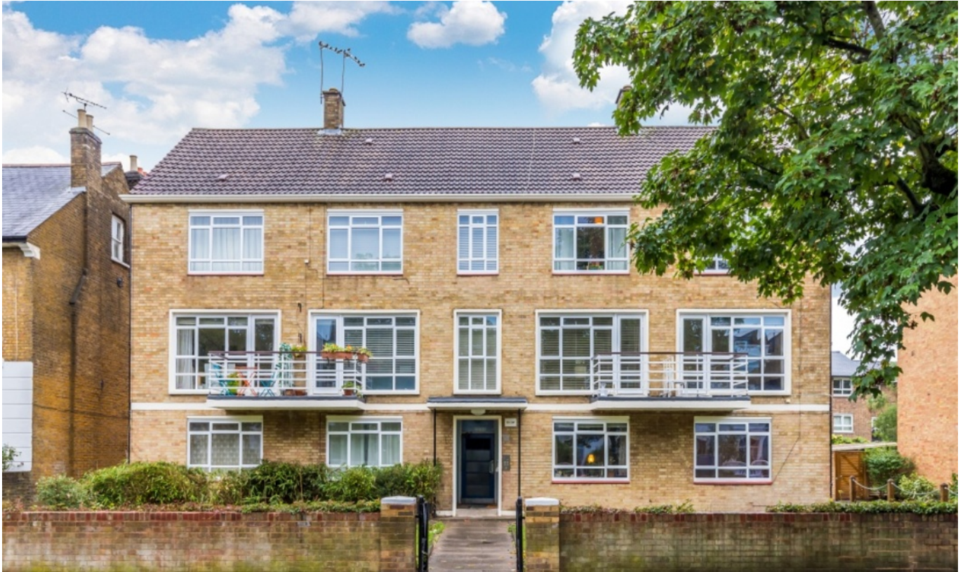
ASHCHURCH PARK VILLAS W12 • ASHCHURCH AREA £350 PW / £1516 PCM