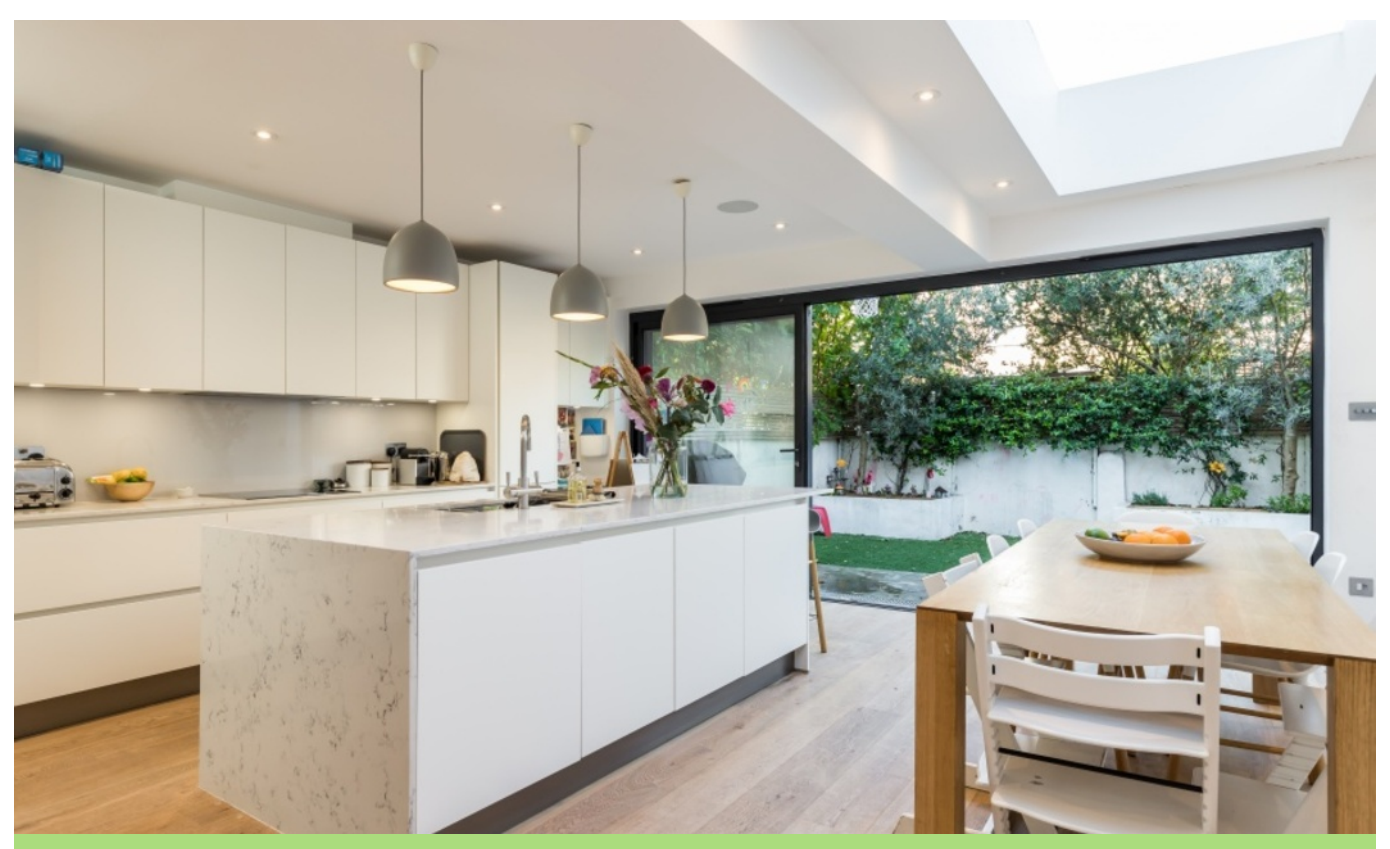
BASSEIN PARK ROAD W12 • WENDELL PARK £875 PW / £3791 PCM