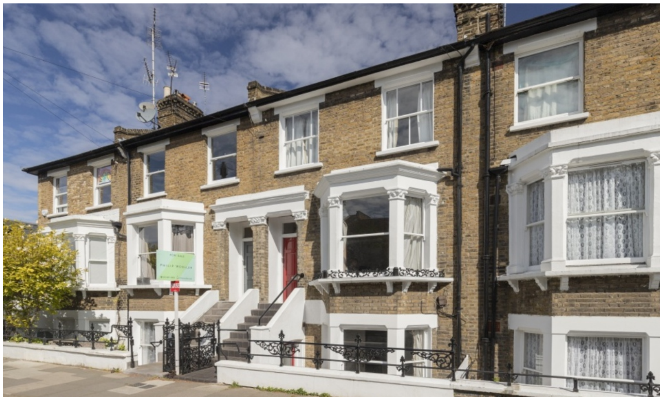
ALDENSLEY ROAD W6 • BRACKENBURY VILLAGE £1,400,000 FREEHOLD