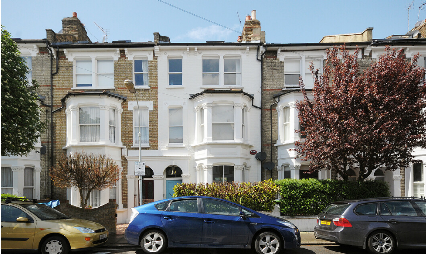
DAVISVILLE ROAD W12 • ASKEW ROAD AREA £950 PW / £4116 PCM