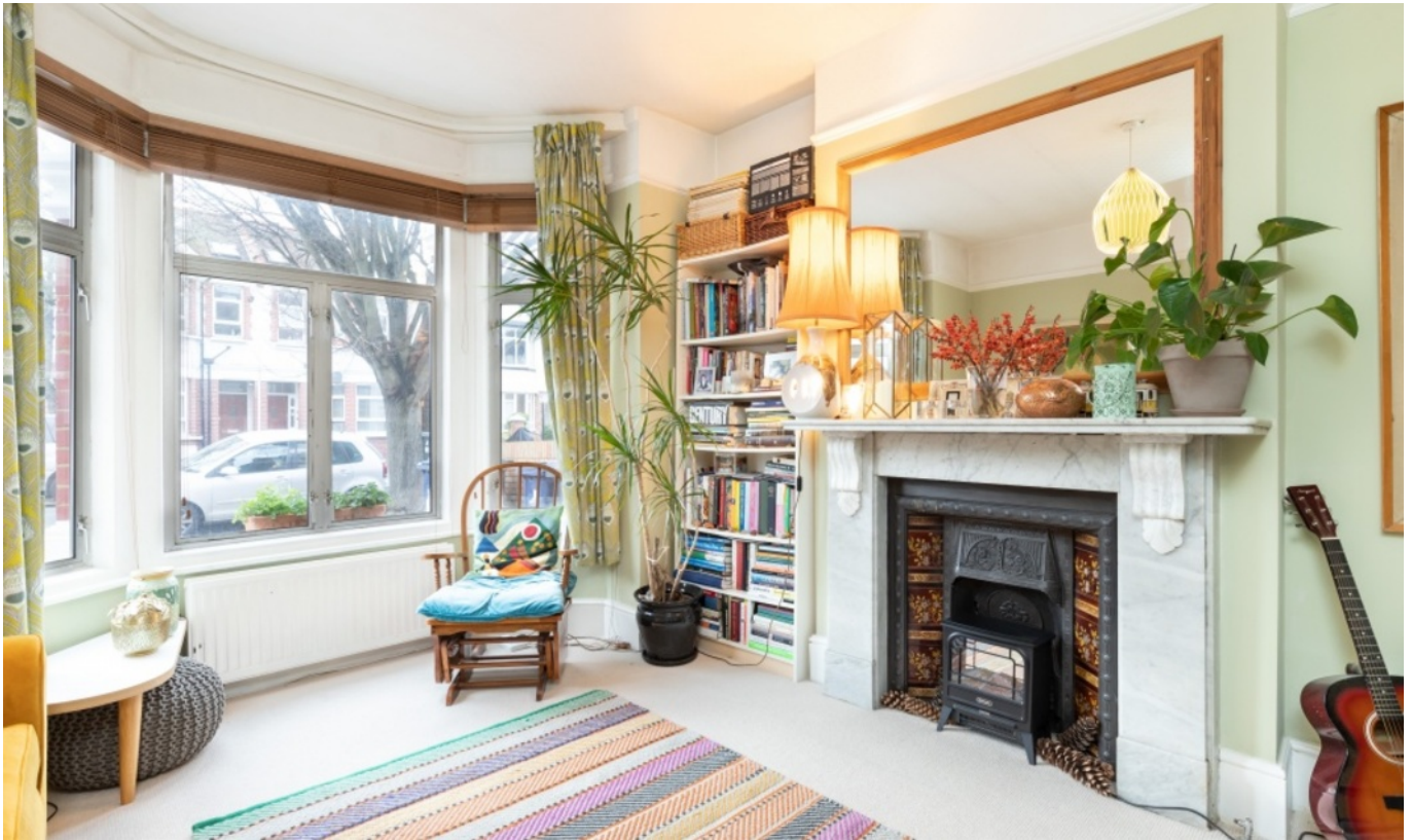
AGNES ROAD W3 • ASKEW ROAD AREA £675,000 LEASEHOLD