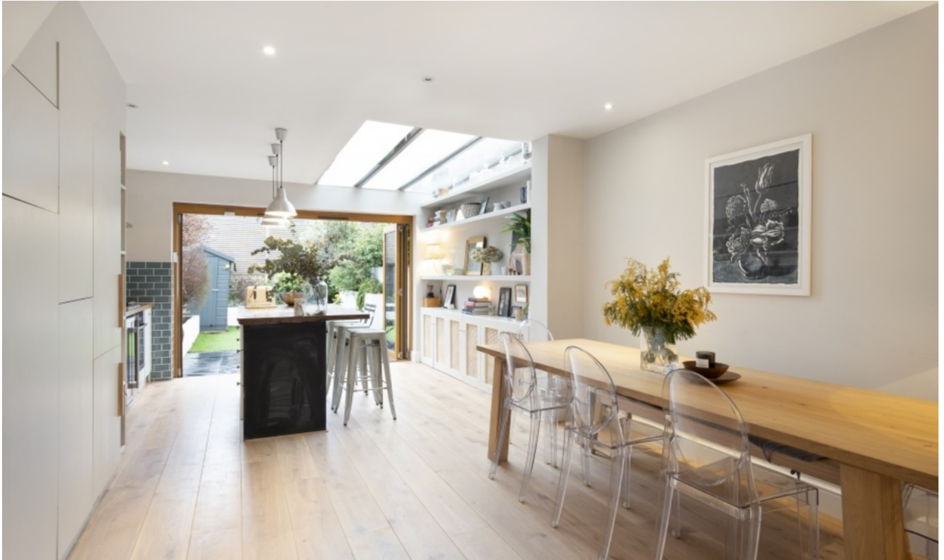
LEFROY ROAD W12 • WENDELL PARK £975,000 FREEHOLD