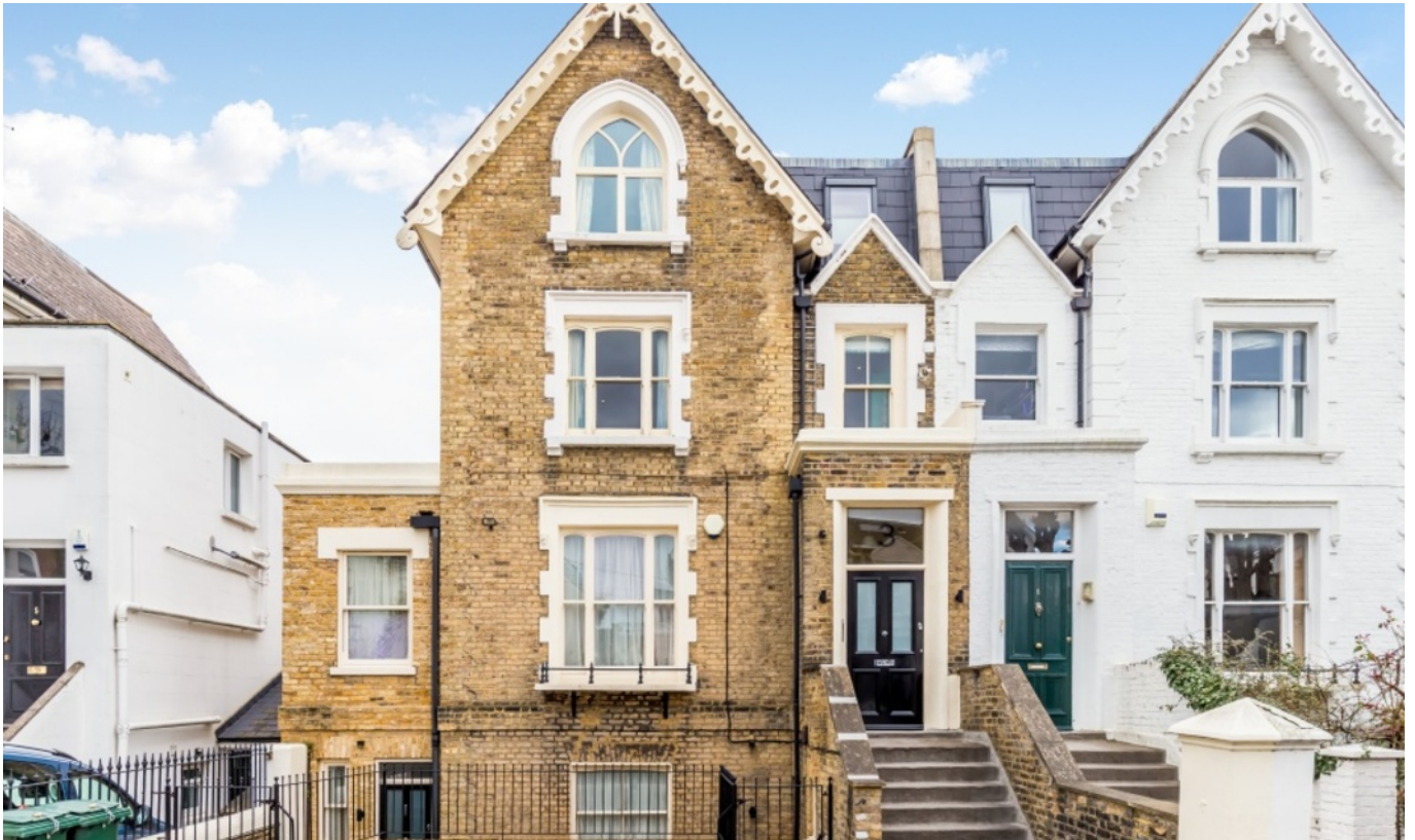
ST STEPHENS AVENUE W12 • SHEPHERD'S BUSH £750,000 SHARE OF FREEHOLD