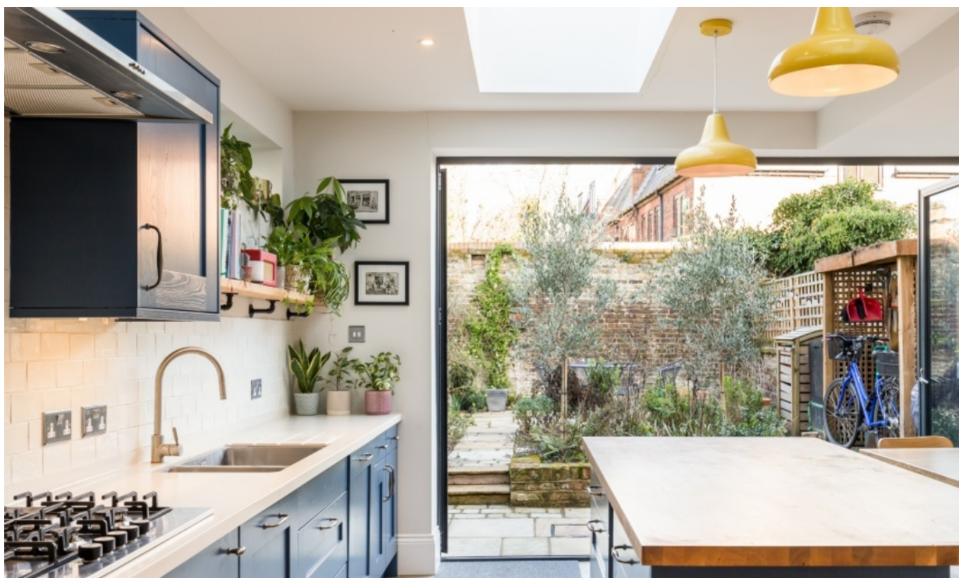
GOODWIN ROAD W12 • SHEPHERD'S BUSH £895,000 SHARE OF FREEHOLD