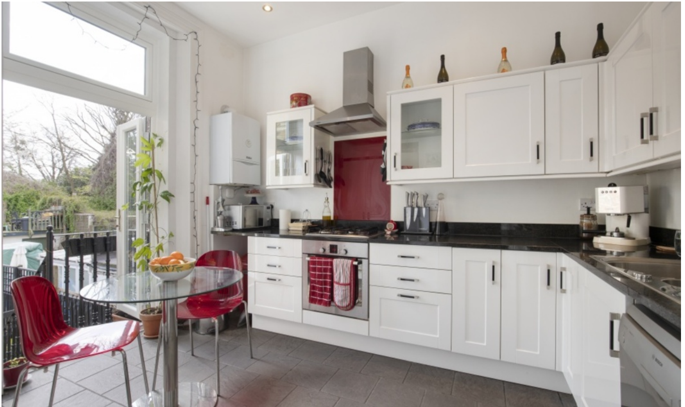
BASSEIN PARK ROAD W12 • ASKEW ROAD AREA £438 PW / £1900 PCM