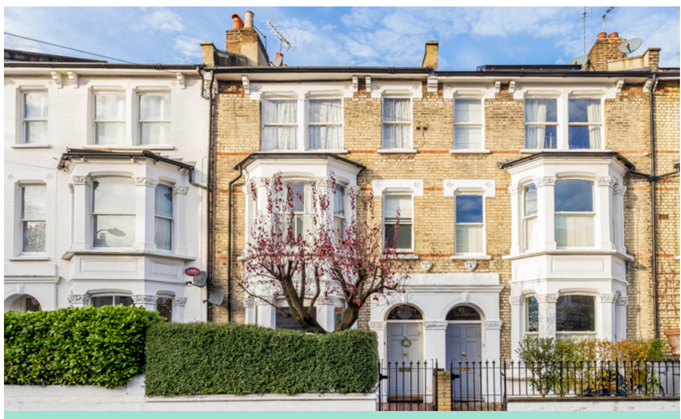
DAVISVILLE ROAD W12 • ASKEW ROAD AREA £1,495,000 FREEHOLD