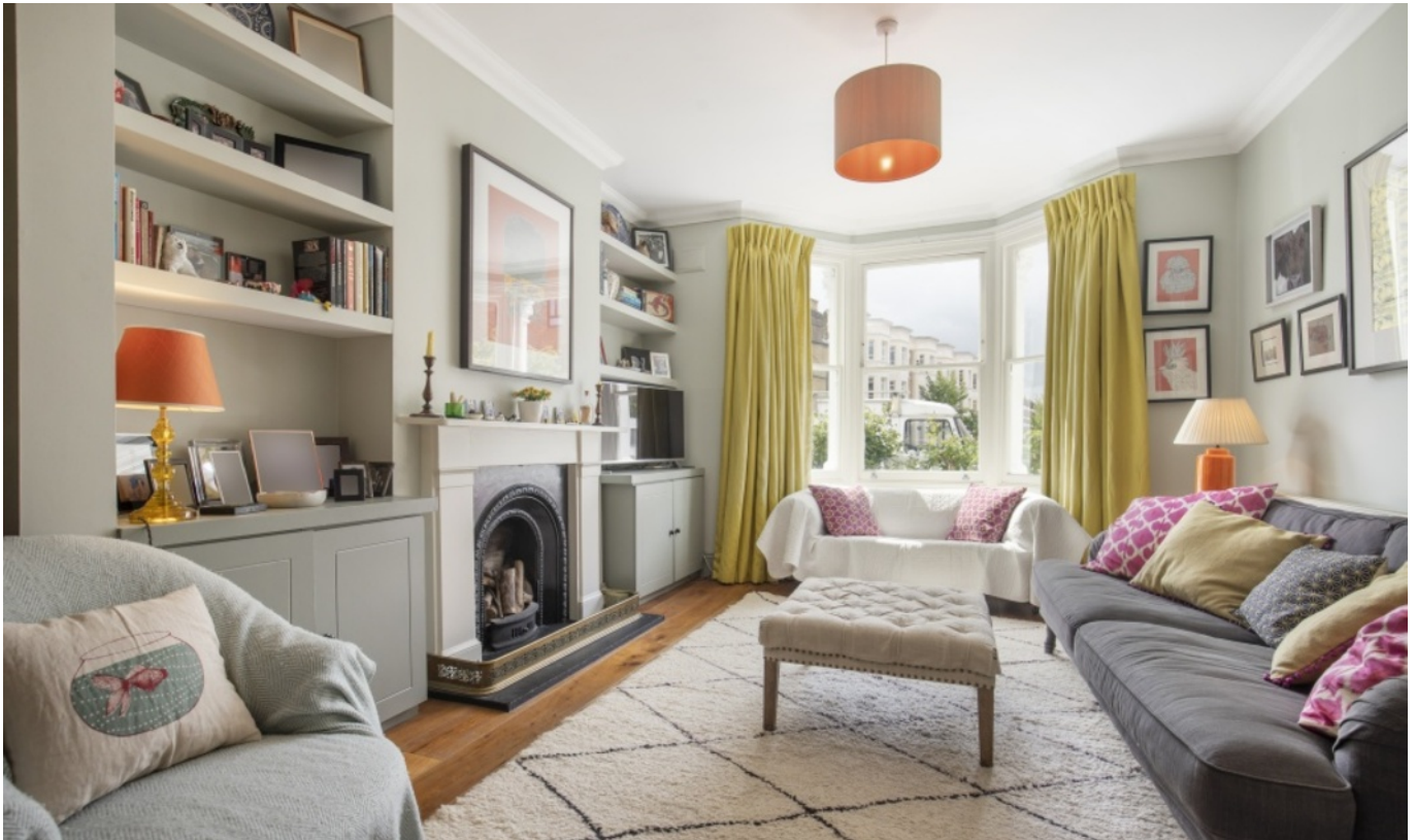
HADYN PARK ROAD W12 • ASKEW ROAD AREA £750 PW / £3250 PCM