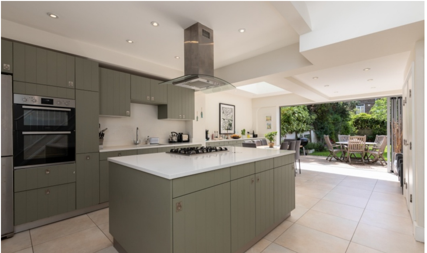
BENBOW ROAD W6 • BRACKENBURY VILLAGE £2,200,000 FREEHOLD