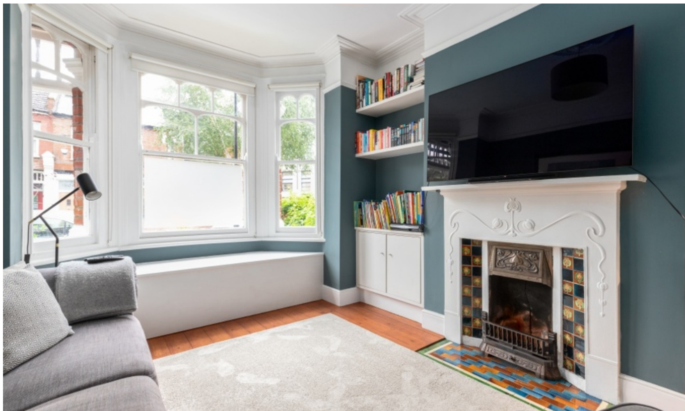
VALETTA ROAD W3 • WENDELL PARK £395 PW / £1711 PCM