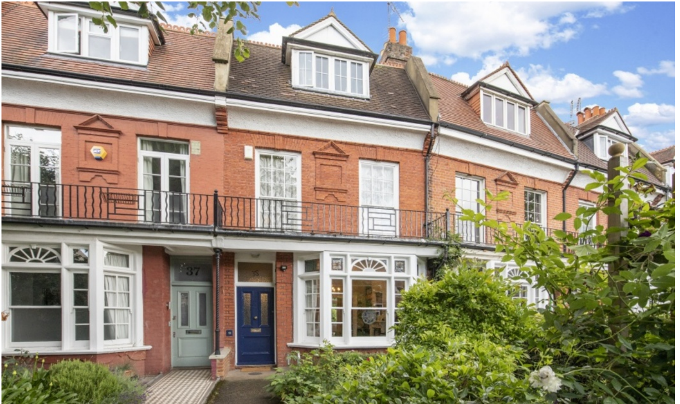
ASHCHURCH GROVE W12 • ASHCHURCH AREA £1,750,000 FREEHOLD