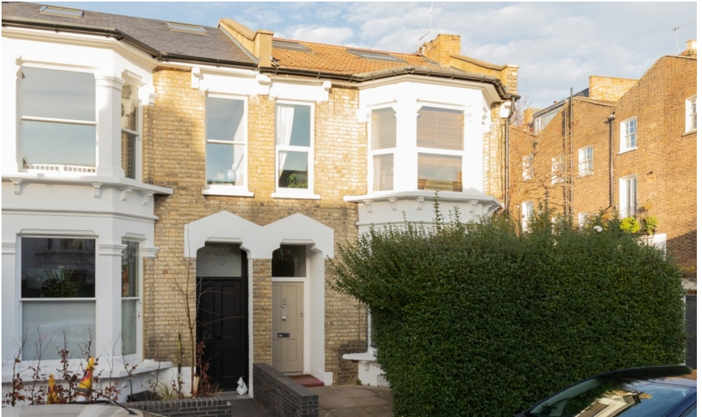
KEITH GROVE W12 • SHEPHERD'S BUSH £440 PW / £1906 PCM