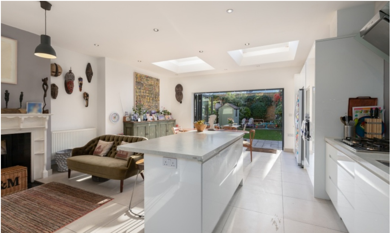
WENDELL ROAD W12 • WENDELL PARK £900 PW / £3900 PCM