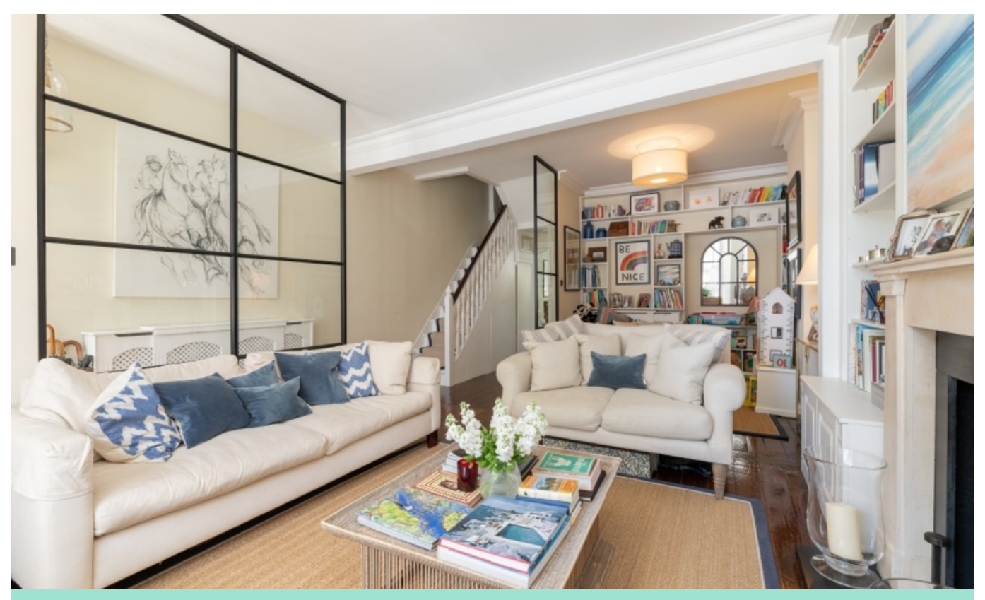
KINNEAR ROAD W12 • WENDELL PARK £1,450,000 FREEHOLD