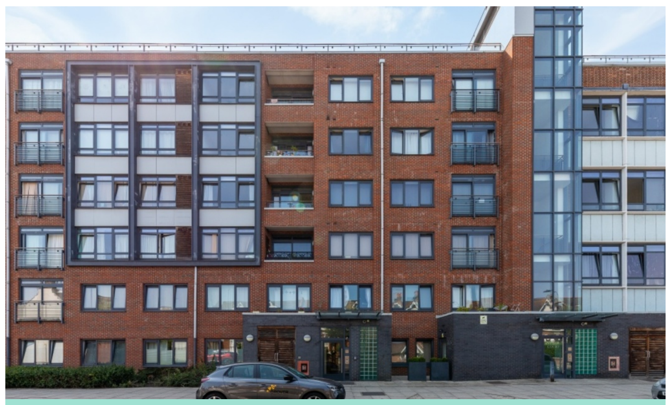
VANDERVELL COURT, LARDEN ROAD W3 • WENDELL PARK £325,000 LEASEHOLD