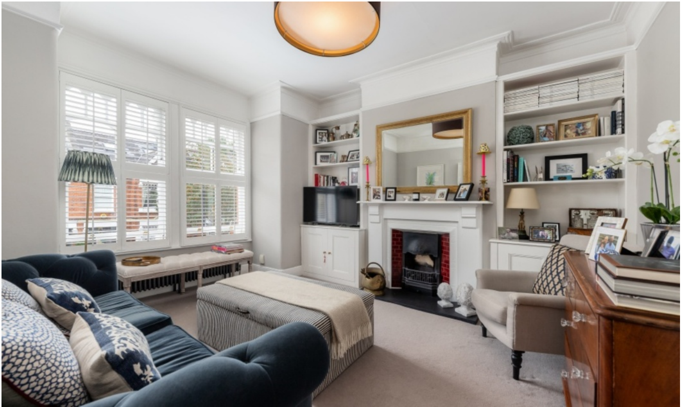
JEDDO ROAD W12 • WENDELL PARK £950,000 SHARE OF FREEHOLD