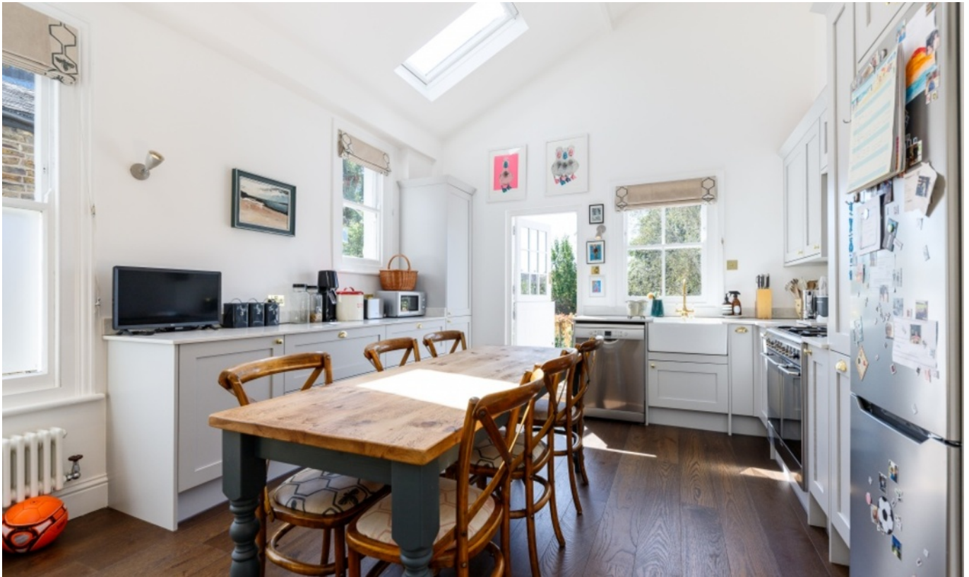
JEDDO ROAD W12 • WENDELL PARK £1,050,000 SHARE OF FREEHOLD