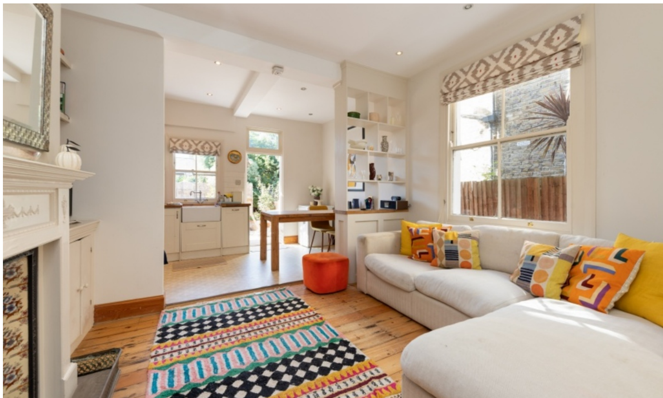
JEDDO ROAD W12 • WENDELL PARK £450 PW / £1950 PCM