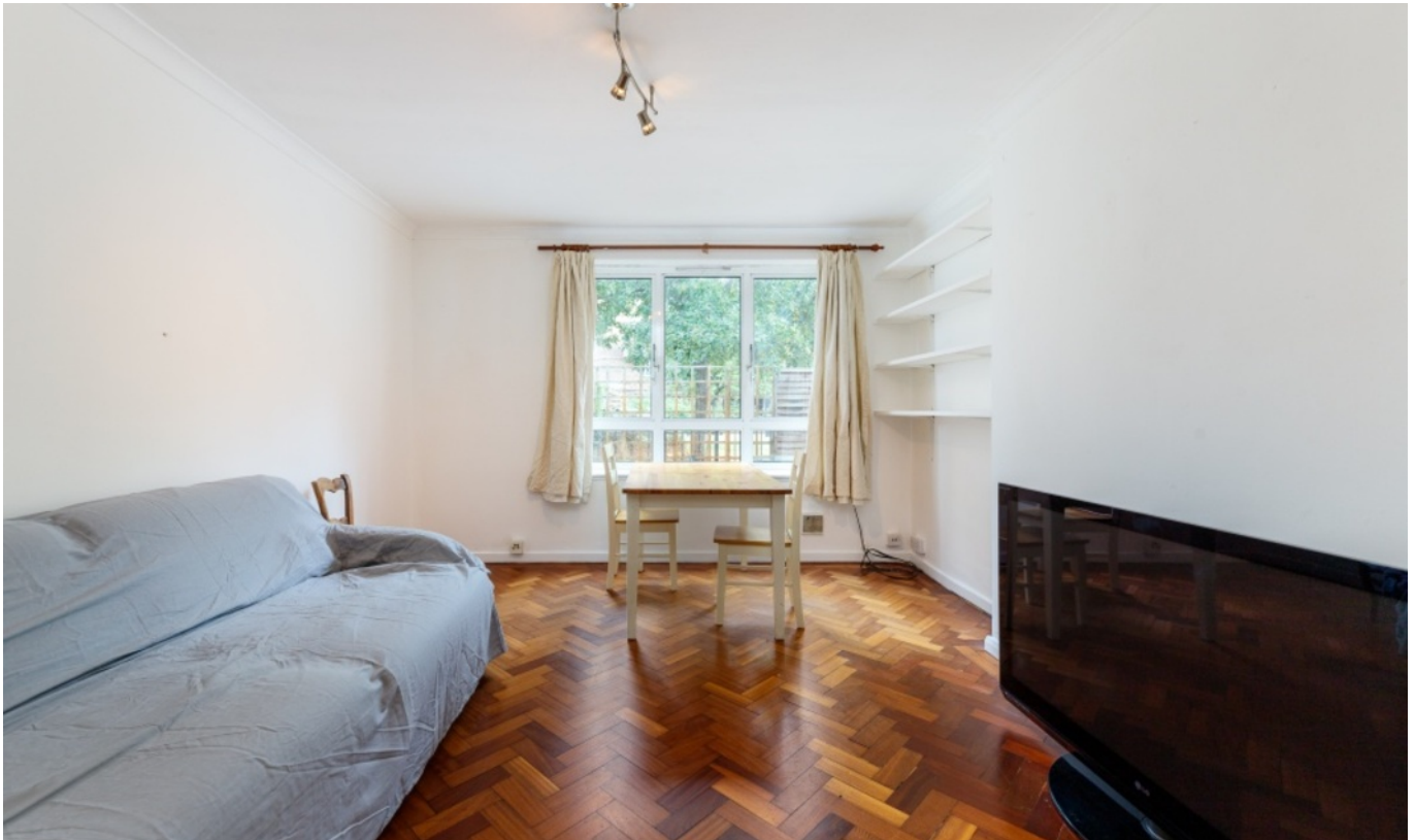
BENNETT STREET W4 • CHISWICK £415 PW / £1800 PCM