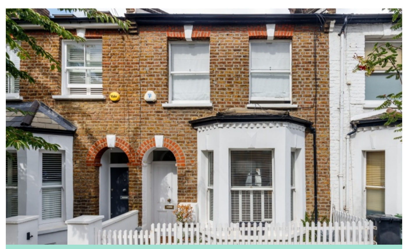
GAYFORD ROAD W12 • ASKEW ROAD AREA £750,000 FREEHOLD