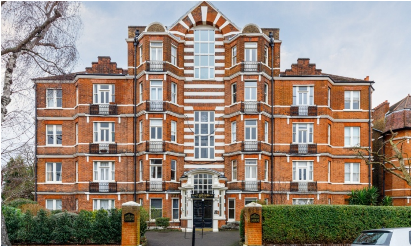
RANELAGH GARDENS, STAMFORD BROOK AVENUE W6 • STAMFORD BROOK £575 PW / £2491 PCM