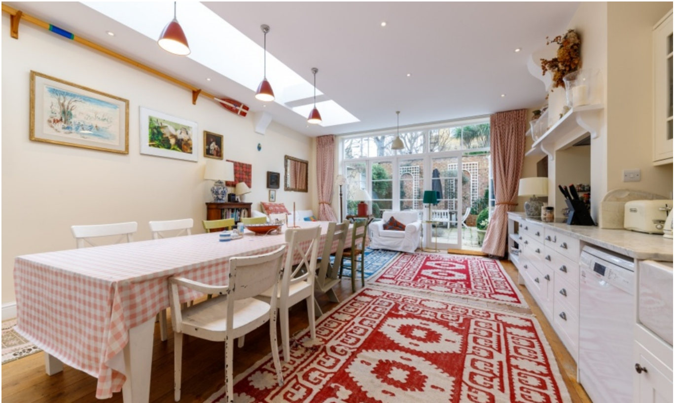
MELROSE GARDENS W6 • BROOK GREEN £2,375,000 FREEHOLD