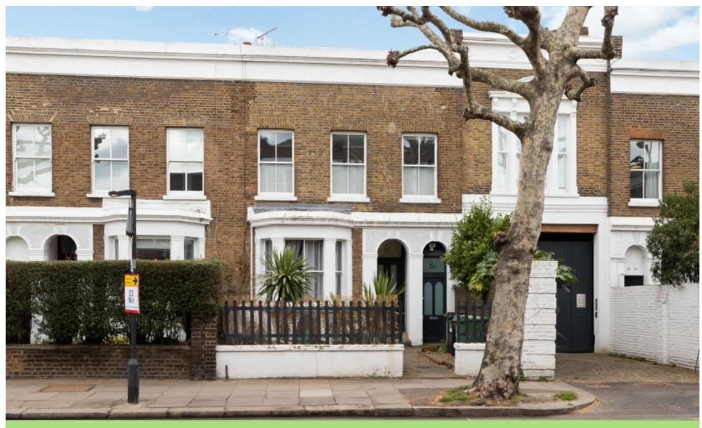
STAMFORD BROOK ROAD W6 • STAMFORD BROOK £250 PW / £1083 PCM