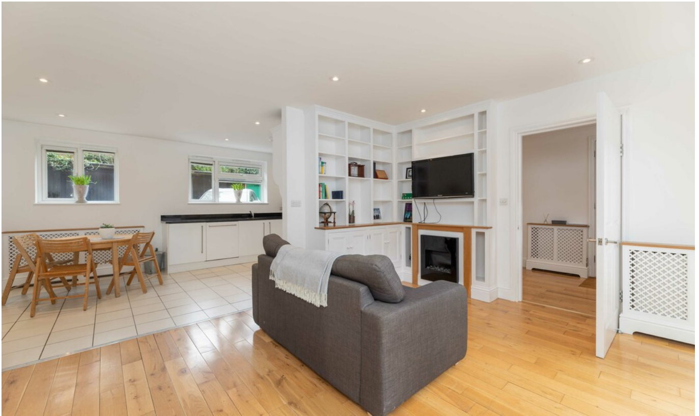
ROCKLEY COURT, ROCKLEY ROAD W14 • BROOK GREEN £795,000 LEASEHOLD