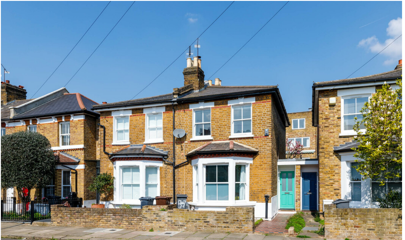
GLEBE STREET W4 • DEVONSHIRE ROAD AREA £1,100,000 FREEHOLD