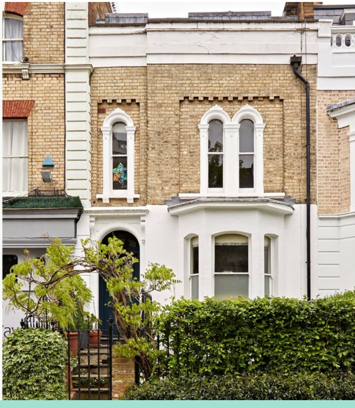
ASHCHURCH TERRACE W12 • ASHCHURCH AREA GUIDE PRICE £1,900,000 FREEHOLD