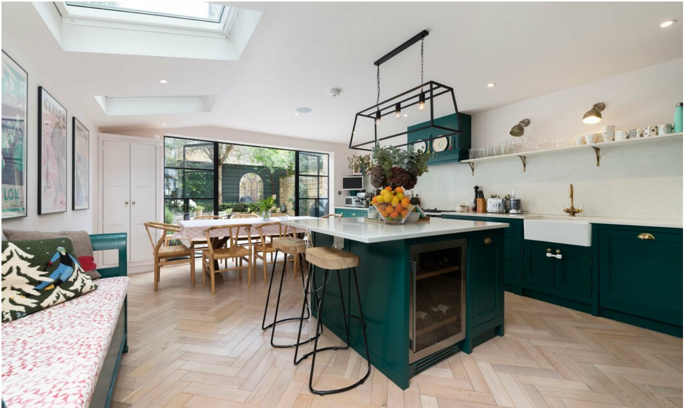
BECKLOW ROAD W12 • WENDELL PARK £1,500,000 FREEHOLD