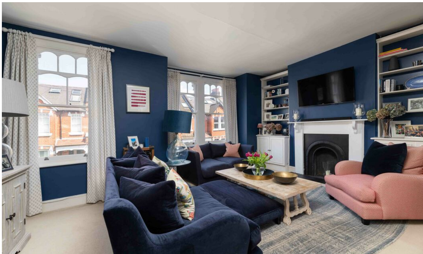
ORMISTON GROVE W12 • SHEPHERD'S BUSH £895,000 SHARE OF FREEHOLD