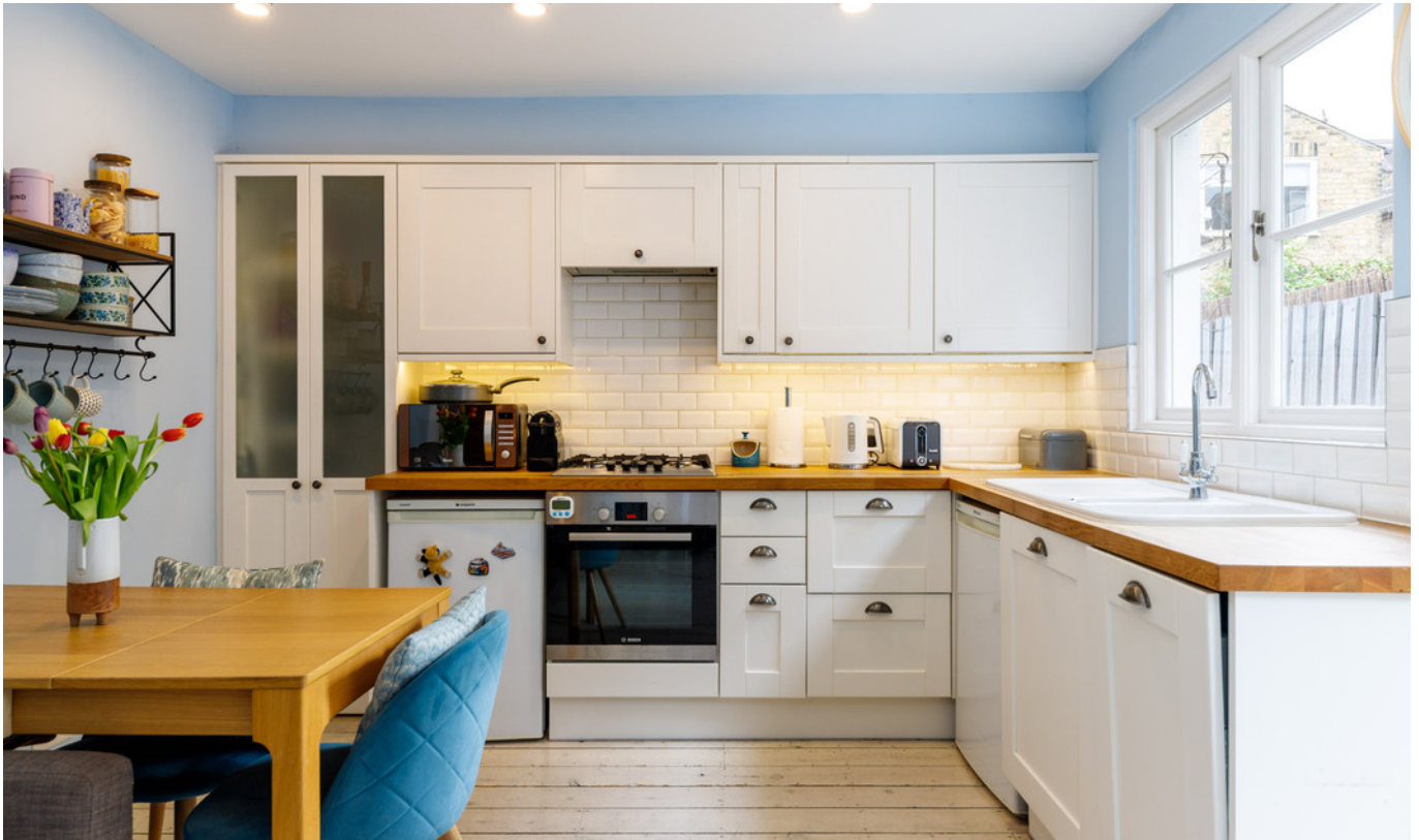
OAKLANDS GROVE W12 • SHEPHERD'S BUSH £545,000 SHARE OF FREEHOLD