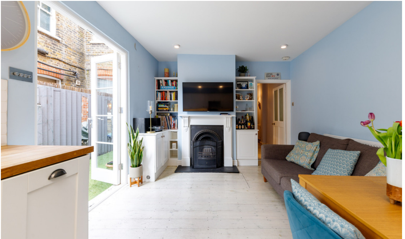
OAKLANDS GROVE W12 • SHEPHERD'S BUSH £535,000 SHARE OF FREEHOLD