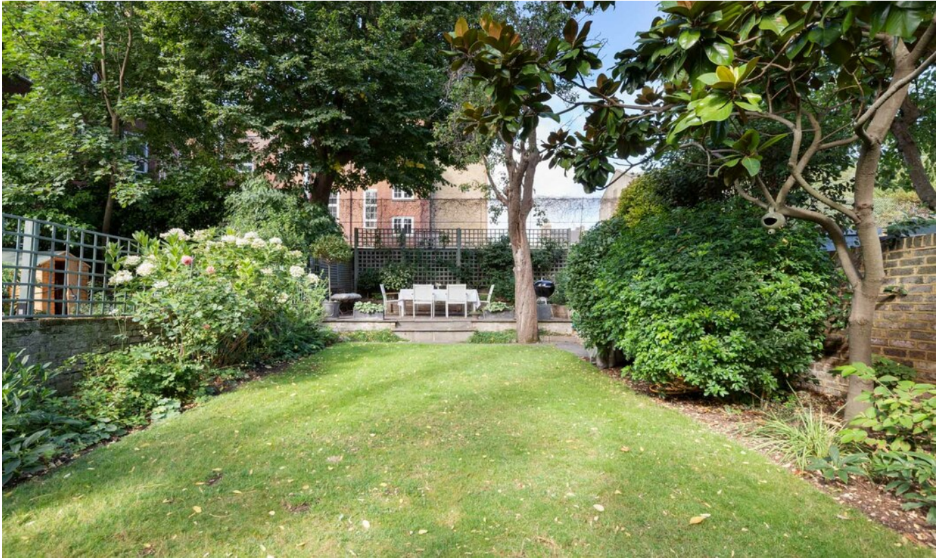
LIME GROVE W12 • SHEPHERD'S BUSH £599,000 SHARE OF FREEHOLD