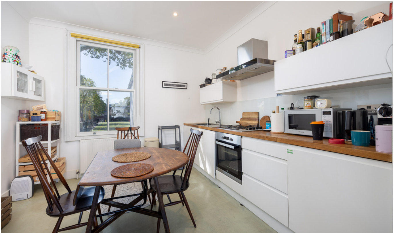
ALDENSLEY ROAD W6 • BRACKENBURY VILLAGE £650,000 SHARE OF FREEHOLD