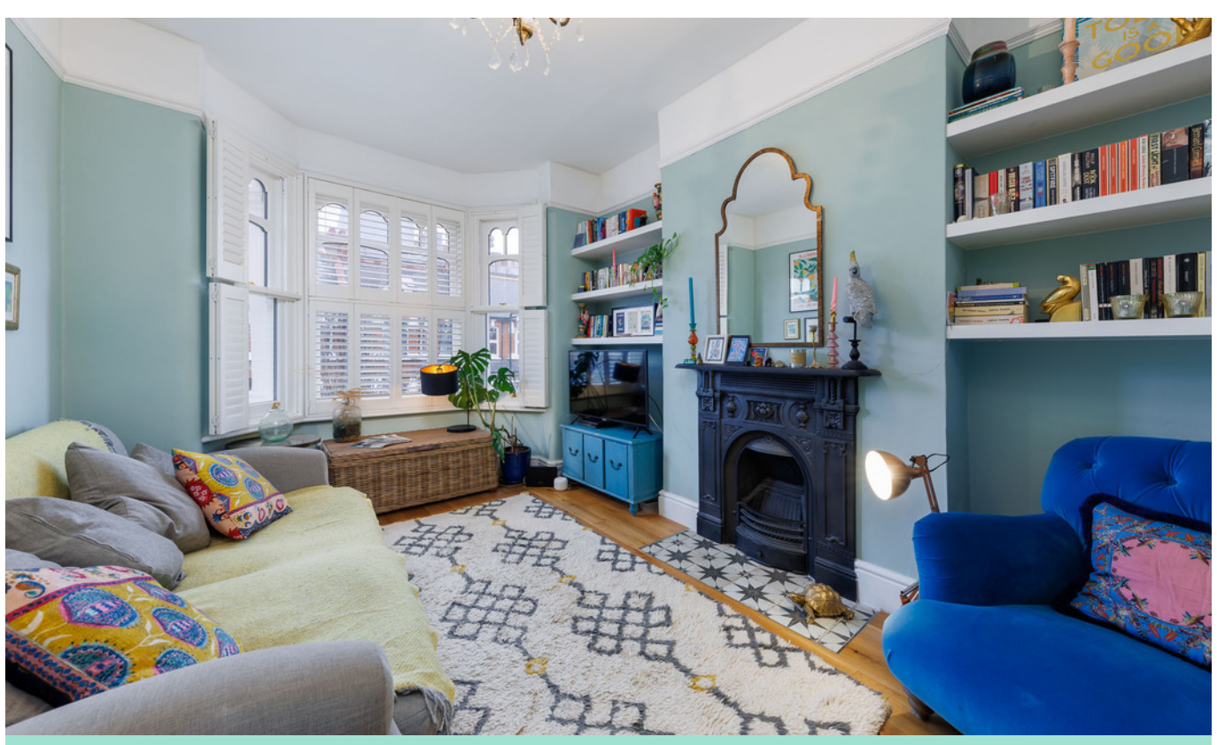
VALETTA ROAD W3 • ASKEW ROAD AREA £875,000 SHARE OF FREEHOLD