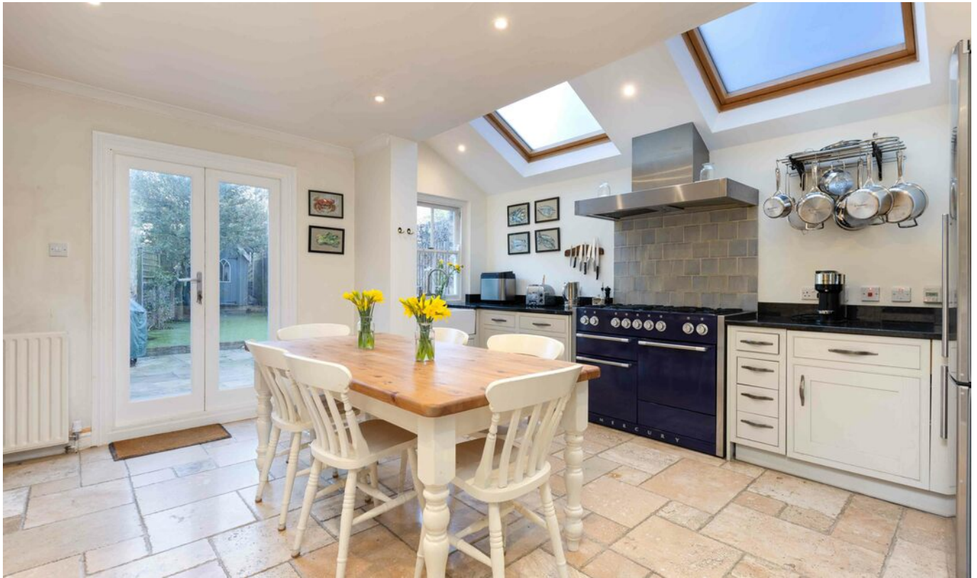
IFFLEY ROAD W6 • BRACKENBURY VILLAGE £1,795,000 FREEHOLD