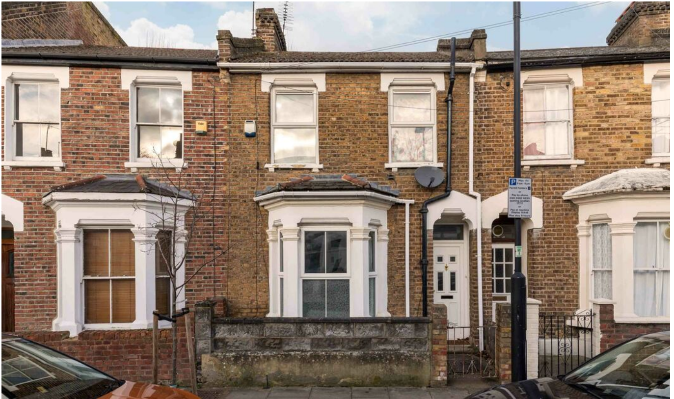
BECKLOW ROAD W12 • WENDELL PARK £795,000 FREEHOLD