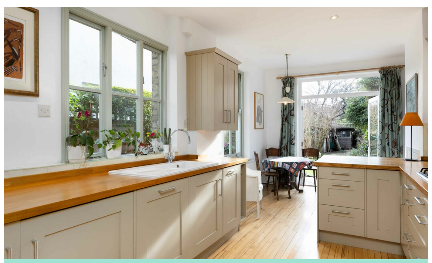
AYCLIFFE ROAD W12 • SHEPHERD'S BUSH £1,250,000 FREEHOLD