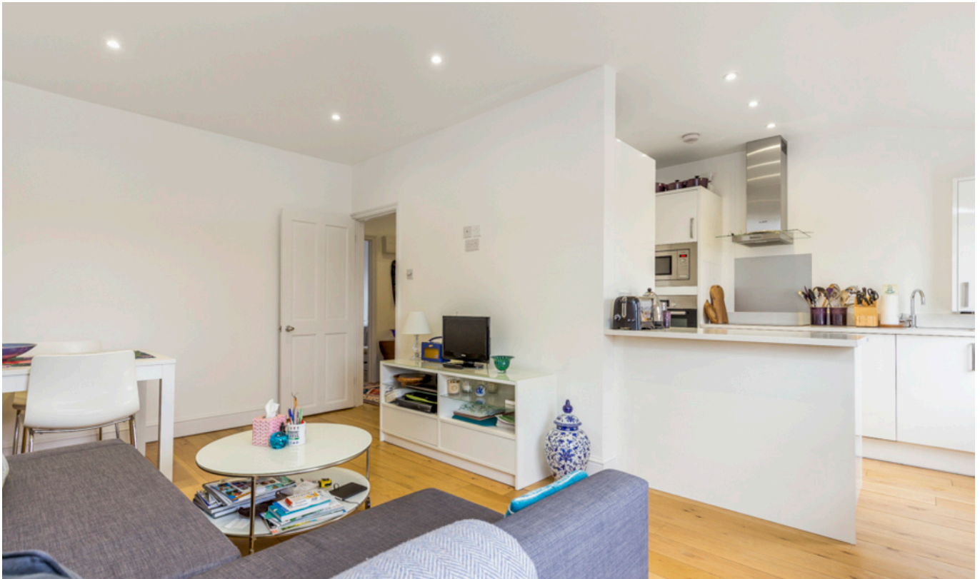
CONINGHAM ROAD W12 • SHEPHERD'S BUSH £445,000 SHARE OF FREEHOLD