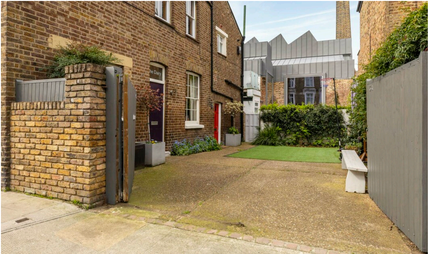
ADELAIDE GROVE W12 • SHEPHERD'S BUSH £725,000 SHARE OF FREEHOLD