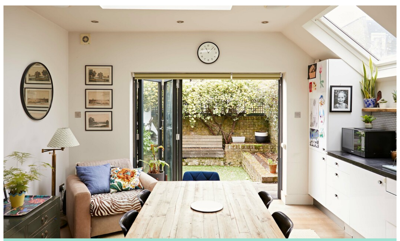
BECKLOW ROAD W12 • ASKEW ROAD AREA £1,300,000 FREEHOLD