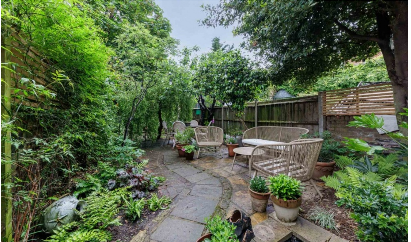
BASSEIN PARK ROAD W12 • ASKEW ROAD AREA £495,000 SHARE OF FREEHOLD