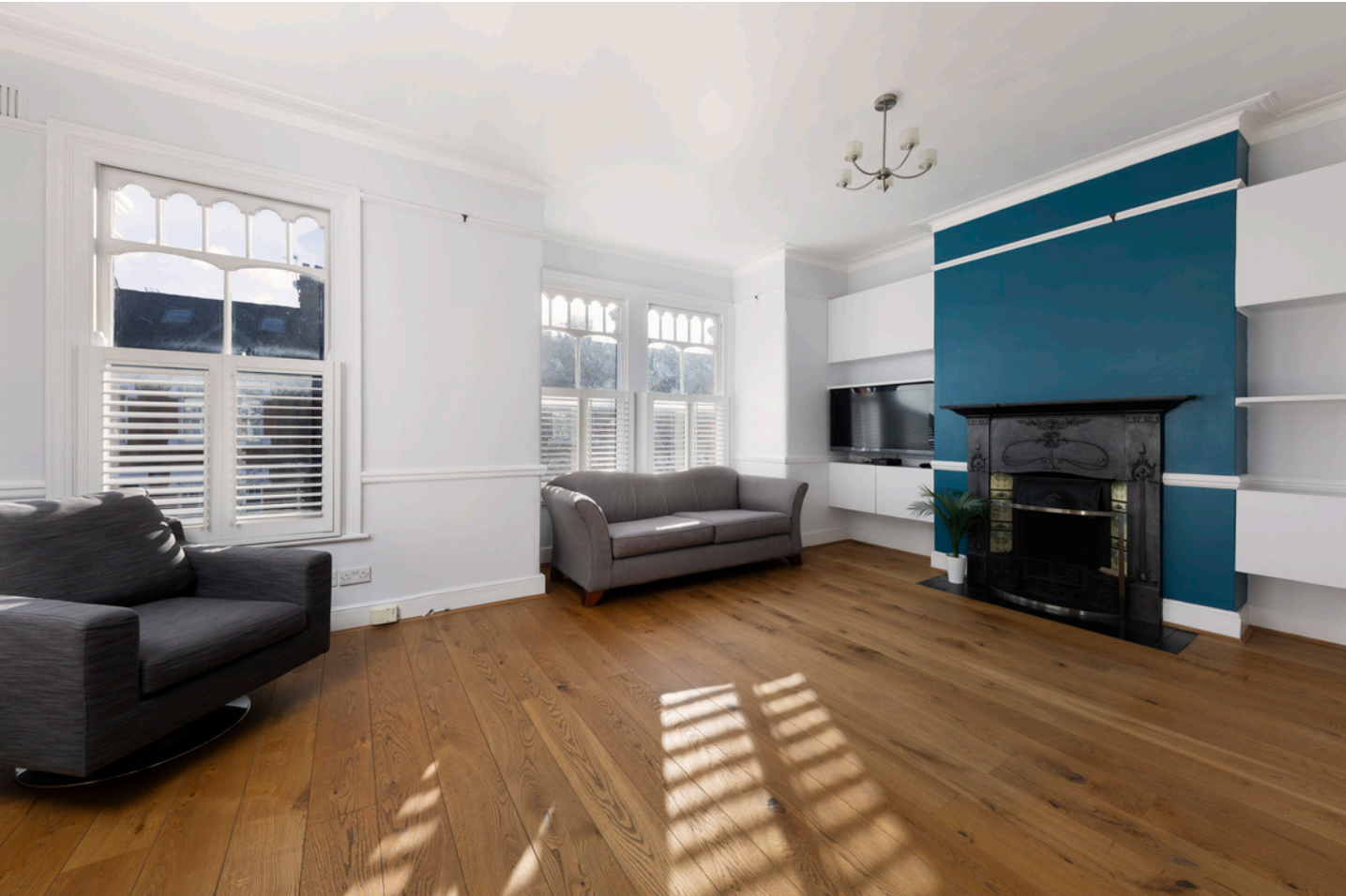
JEDDO ROAD W12 • ASKEW ROAD AREA £920,000 FREEHOLD