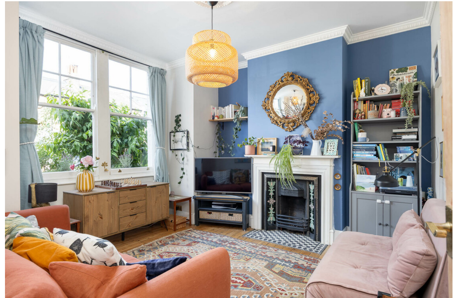
AYLMER ROAD, LONDON • WENDELL PARK £650,000 LEASEHOLD