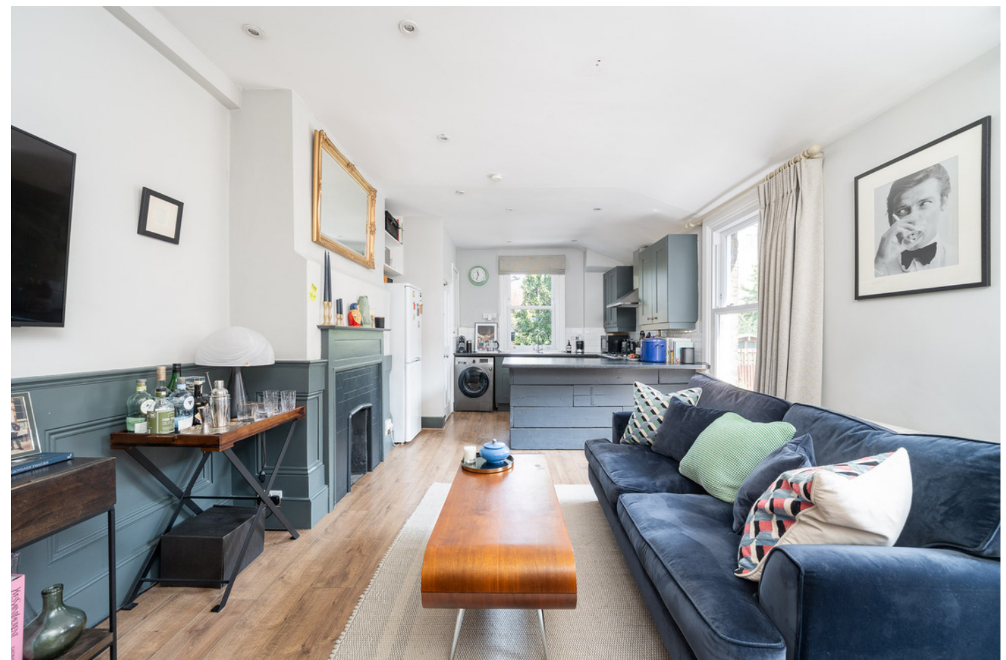
DUNRAVEN ROAD W12 • SHEPHERD'S BUSH £665,000 LEASEHOLD