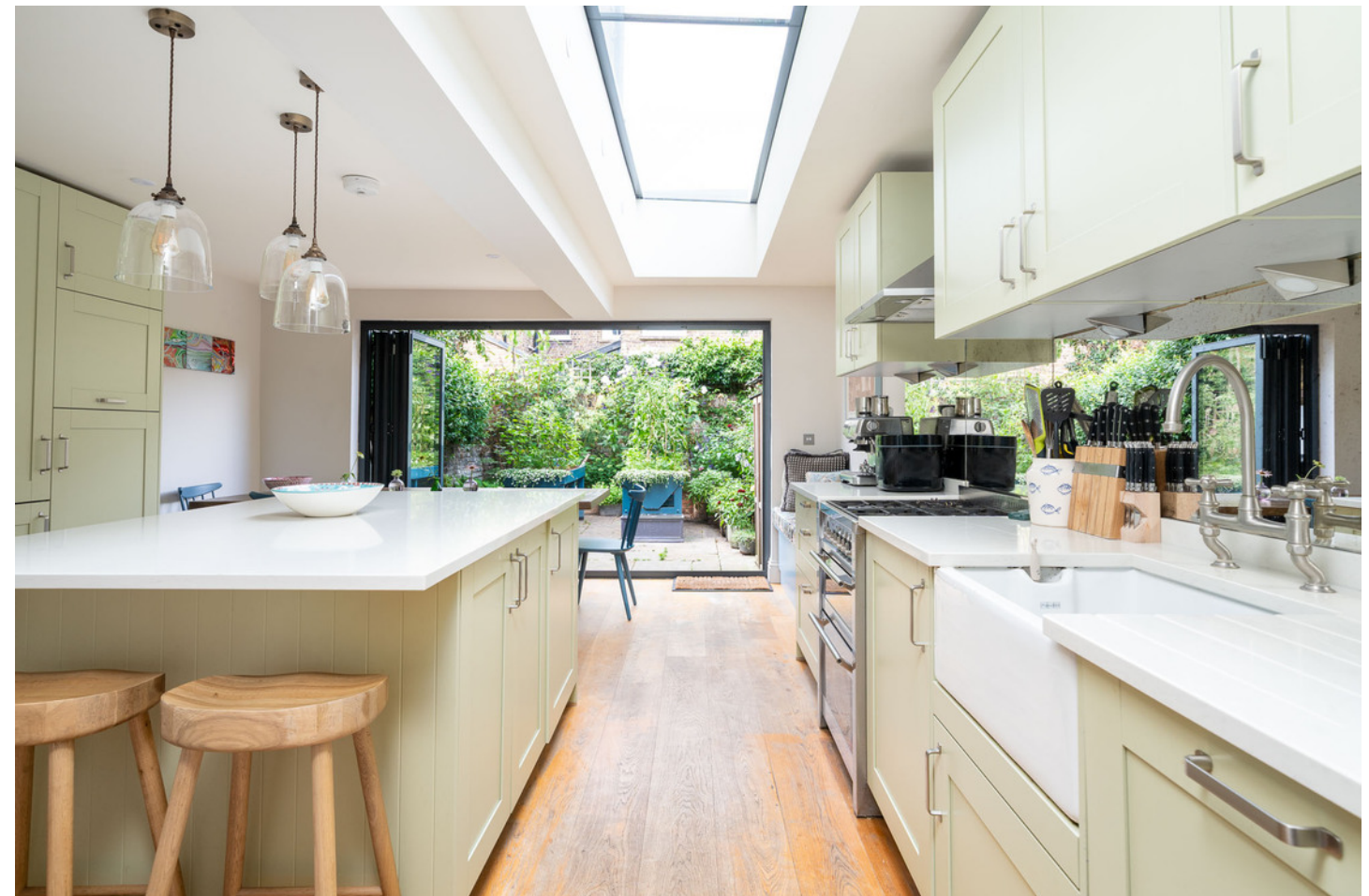
GAYFORD ROAD W12 • ASKEW ROAD AREA £1,425,000 FREEHOLD